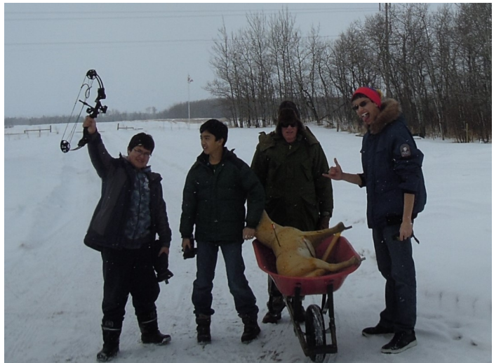
The Birthday boy brings home the bacon...