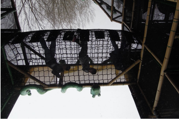
Can even handle jungle gyms in the winter.