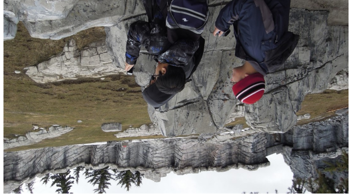
Pretty good at finding sheep too...