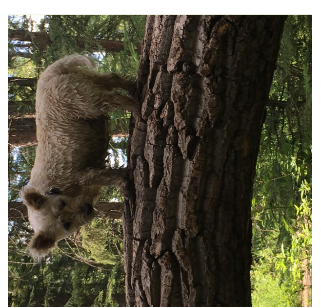
I asked them for some super cat powers so you can chase cats up trees. Really takes the cockiness